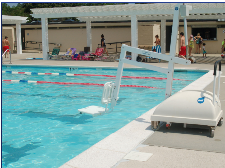
The Portable Aquatic Lift at the Centereach Pool.

These three pools are located in Centereach, Holtsville and Mastic Beach. All sites offer the ADA compliant PAL (Portable Aquatic Lift), which has become the industry standard for providing accessibility to swimming pools. Each facility has handicap accessible bathrooms, and the Aquatic Center in Mastic Beach provides a family changing room where parents and guardians can tend to children and older adults with disabilities before and after entering the pool. Family changing rooms are offered at the Centereach and Holtsville pools upon request. For further information regarding these three locations, please call (631) 451-8696.